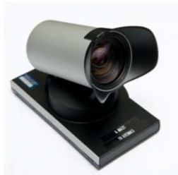
One of the digital cameras CICS uses for providing on-demand, high-definition videoconferencing services.

To become more efficient and find alternatives in order to maintain quality services at a time of fiscal restraint, the organization will continue to invest in new technologies, not only for its day-to-day management, but also for the delivery of its services.