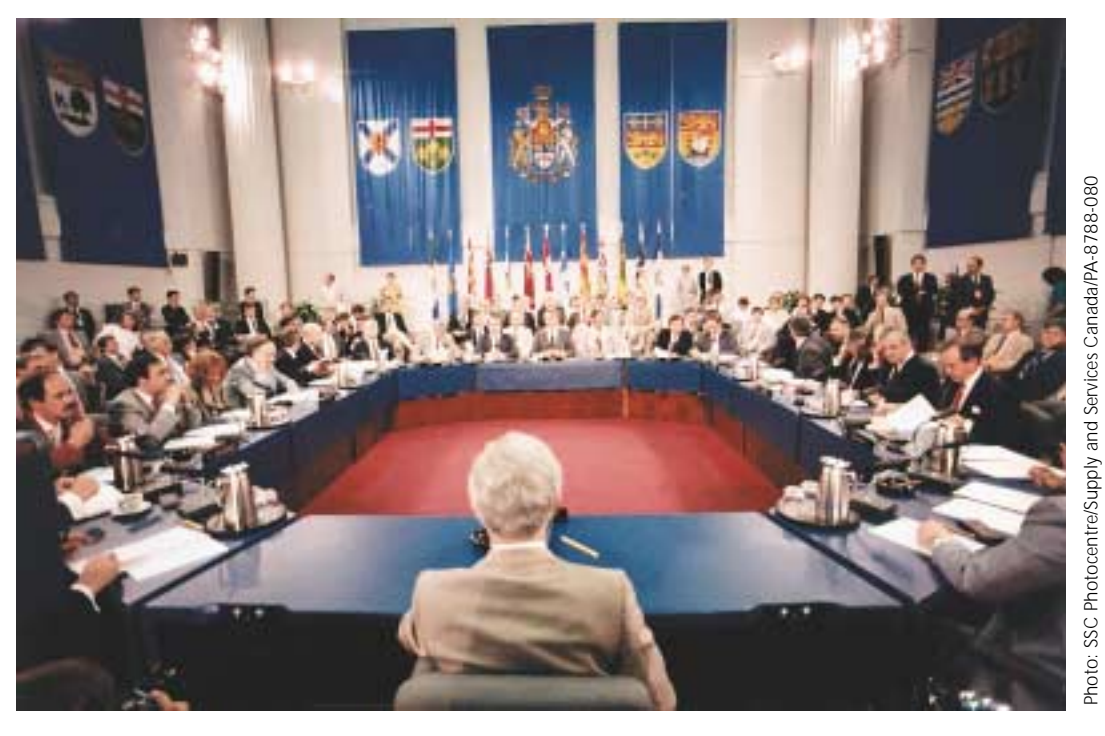
First Ministers' Conference on the Constitution in session