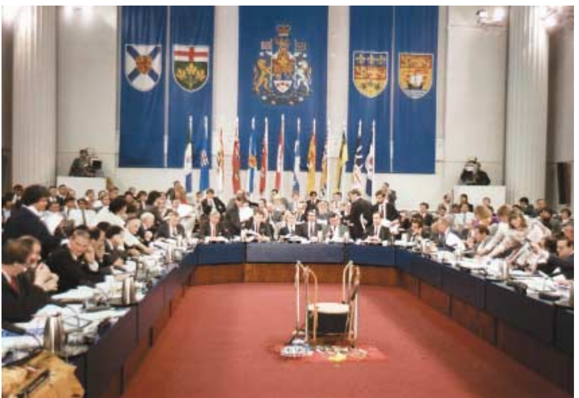
First Ministers' Conference on Aboriginal Constitutional Matters in session