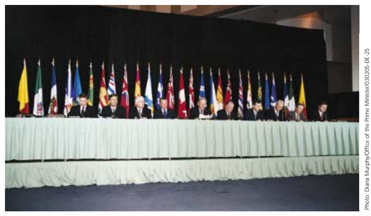
Federal and Provincial First Ministers at a press conference