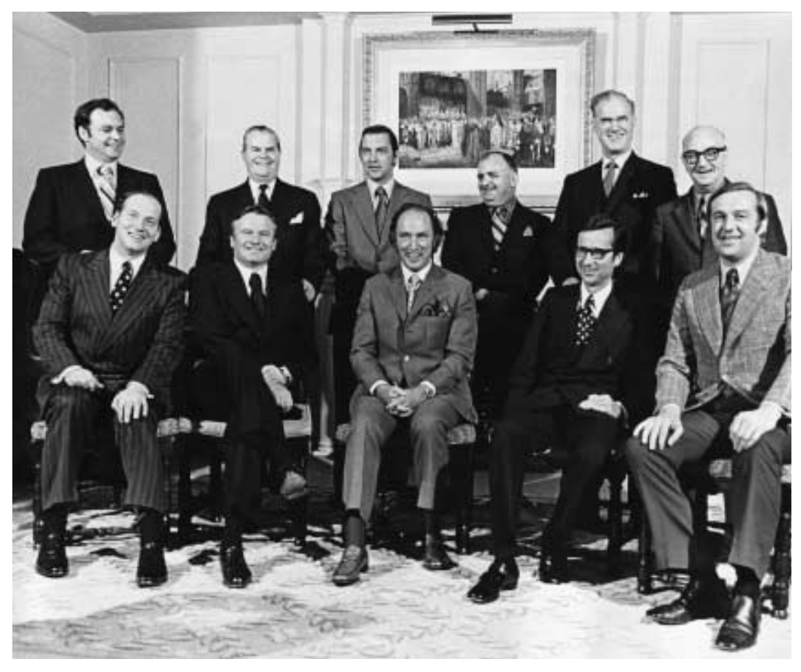
Delegates to the Federal-Provincial Constitutional Conference

By June 28 all governments except Quebec and Saskatchewan had advised the Secretariat that the Charter was acceptable. On June 23 Quebec informed the Secretary that it could not recommend the Charter to its National Assembly because of the clauses dealing with income security. This resulted in eventually arresting for several years the process of constitutional review and patriation of the constitution.