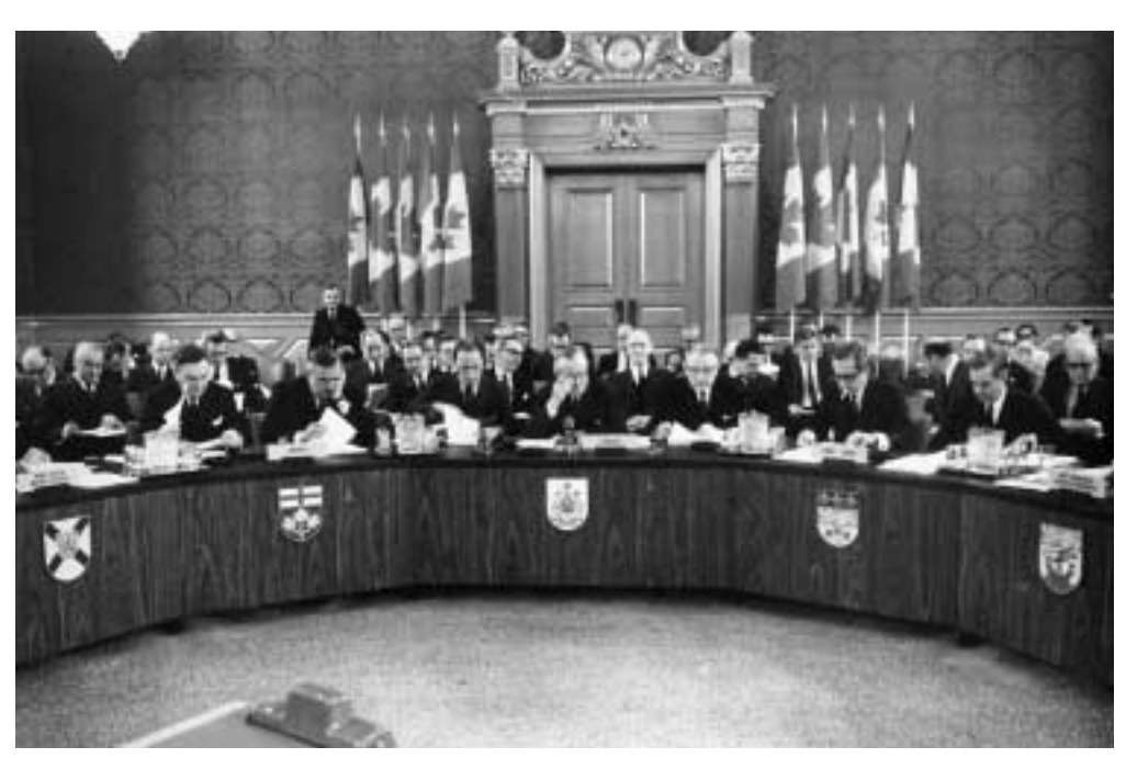
Federal-Provincial Constitutional Conference in session

This Conference marked the beginning of the most comprehensive attempt at constitutional review since Confederation. The Constitutional Conference and the committees of ministers and officials established to support it, were to meet continuously for the next three years until terminated by the failure to reach agreement at the Conference held in Victoria, British Columbia, in June 1971.