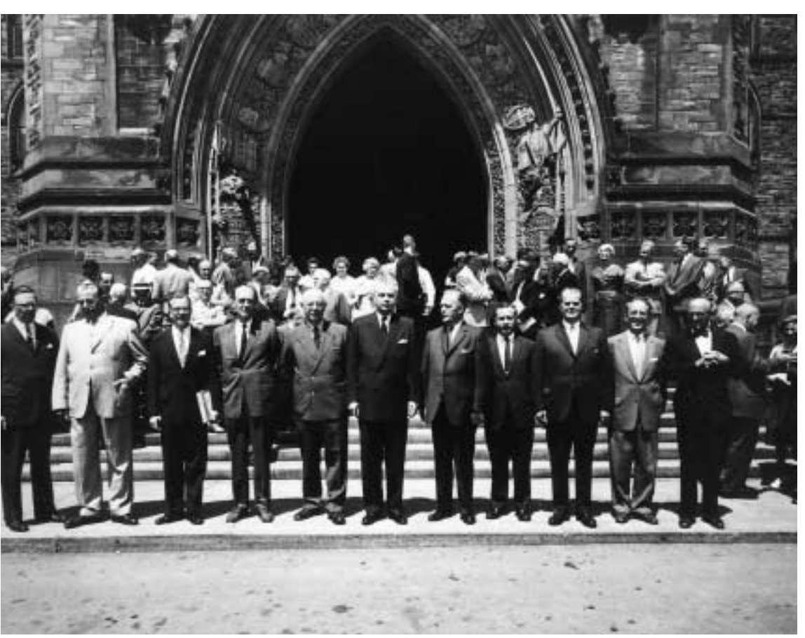
Premiers of Canada's 10 Provinces with Prime Minister John G. Diefenbaker in front of main entrance to the Parliament Buildings